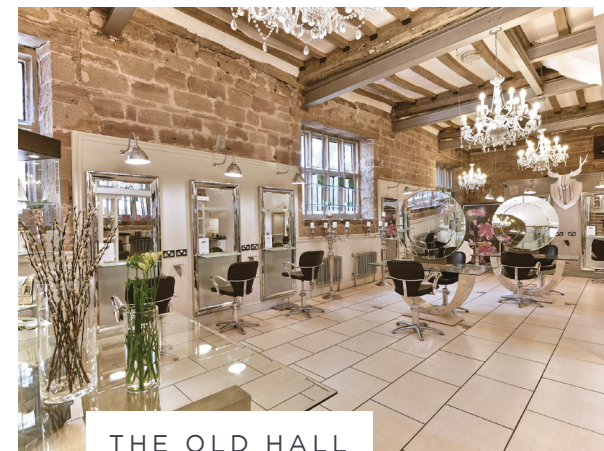
THE OLD HALL

TO BOOK AN APPOINTMENT AT ANY OF OUR BEAUTIFUL SALONS, CALL OUR BOOKING OFFICE ON: 01332 974959